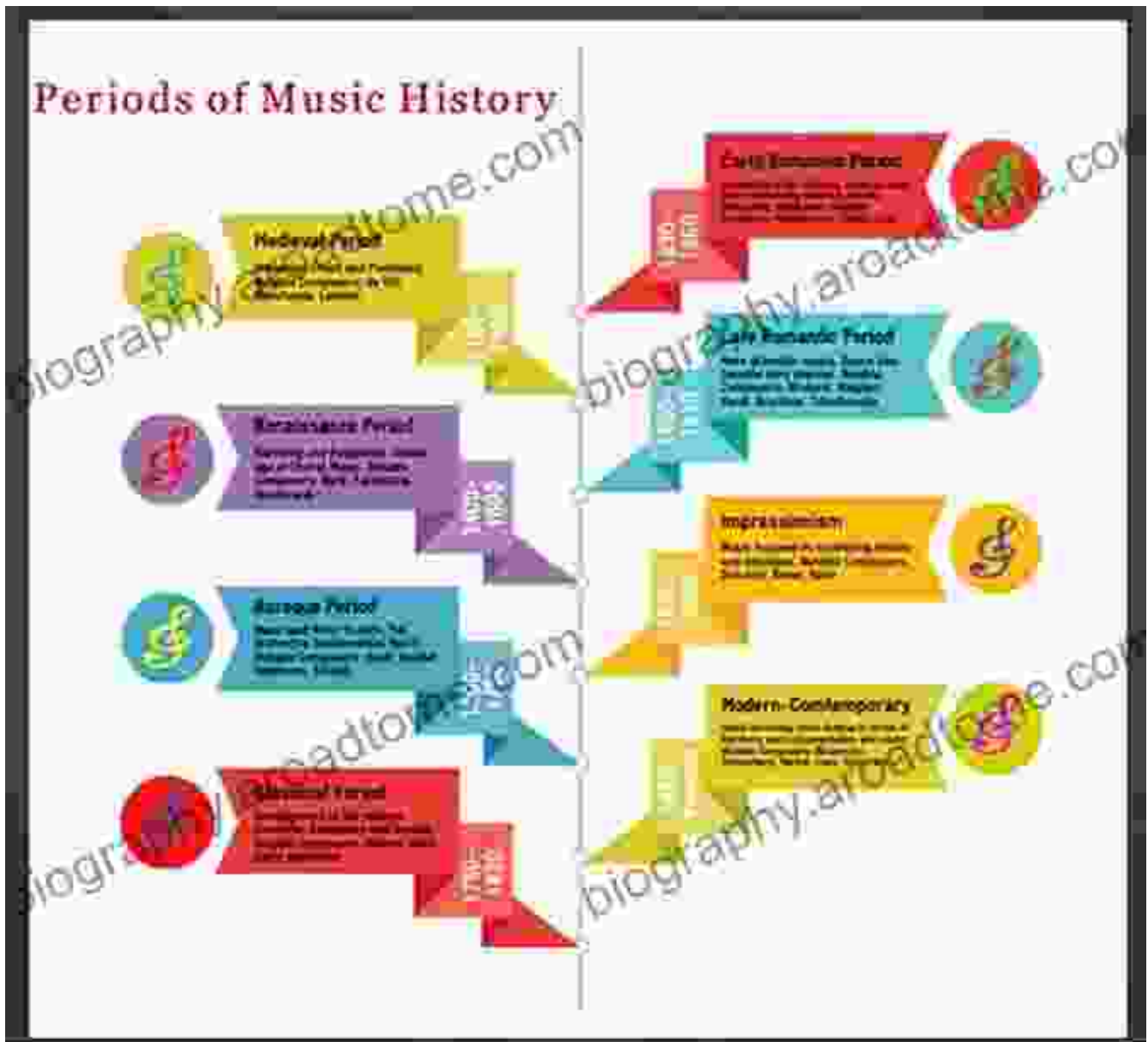
Timeline depicting key events and figures in music history.